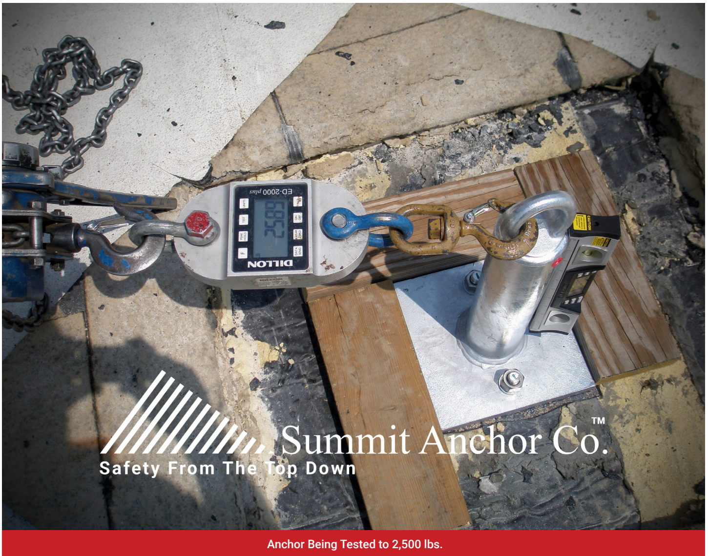
Anchor Being Tested to 2,500 lbs.

Both OSHA and ANSI-I.14 require two independent anchorages for each worker attached. Anchorage layout requirements are more fully addressed in an anchor layout guide for rope descent systems.